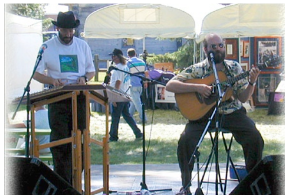
Greenwood Tree performing at the 2000 Brookings Summer Arts Festival